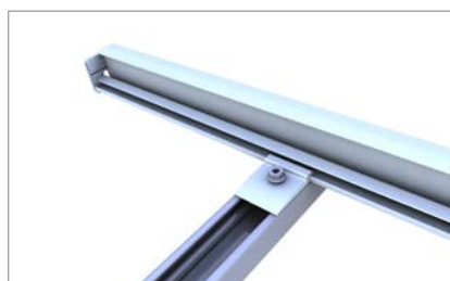
Fixation insertion rail to C-N-rail