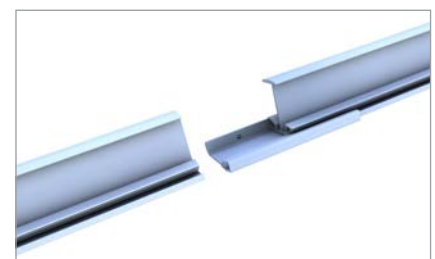
Rail connector insertion rail