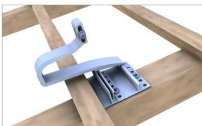
Position of base profile on rafters