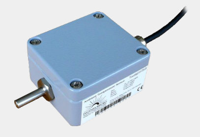
Ambient Temperature sensor