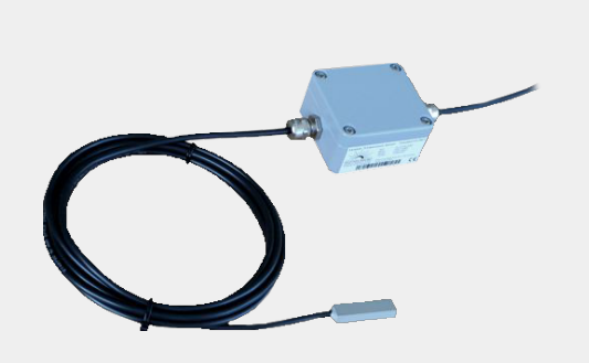
Module Temperature sensor