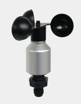
Wind Velocity sensor